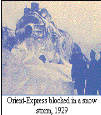
Orient-Express blocked in a snow storm, 1929

In 1872, a 27-year old Belgian, Georges Nagelmackers, created the "Compagnie Internationale de Wagons-Lits". To beat Pullman, who was trying to capture the European market, Nagelmackers had a brilliant idea that would revolutionize European transportation: his trains would not only be the most comfortable and the most luxurious, but they would cross the borders of all of Europe. In 1884, the company became "Compagnie