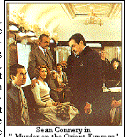
Sean Connery in "Murder on the Orient Express"

In 1872, a 27-year old Belgian, Georges Nagelmackers, created the "Compagnie Internationale de Wagons-Lits". To beat Pullman, who was trying to capture the European market, Nagelmackers had a brilliant idea that would revolutionize European transportation: his trains would not only be the most comfortable and the most luxurious, but they would cross the borders of all of Europe. In 1884, the company became "Compagnie