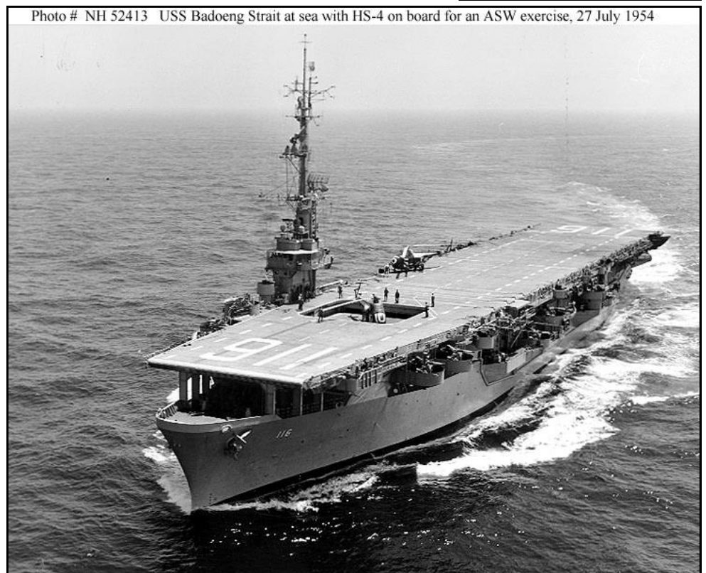
Photo # NH 52413 USS Badoeng Strait at sea with HS-4 on board for an ASW exercise, 27 July 1954