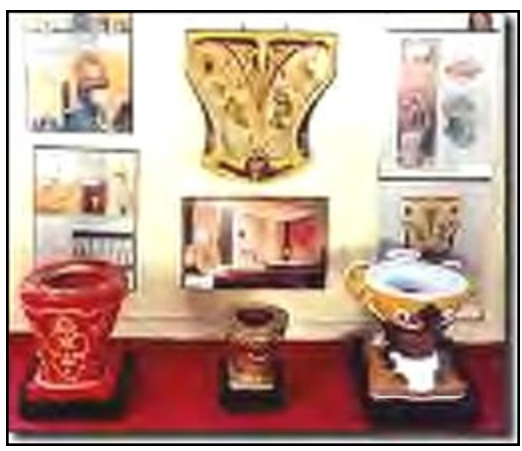
Above - There's actually a Museum of Toilets, New Delhi, India; Below-Roman public toilets