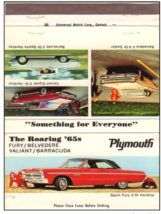
continued on p.3