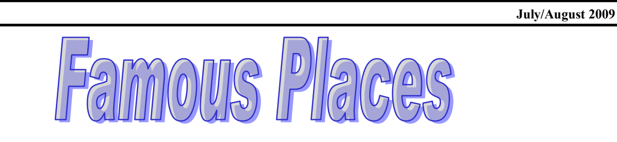
by Mike Prero

A significant part of this hobby is based on nostalgia, and most of us, it seems to me, would have such about Famous Places—not just the famous places that we've actually visited, but many of those we haven't, as well.