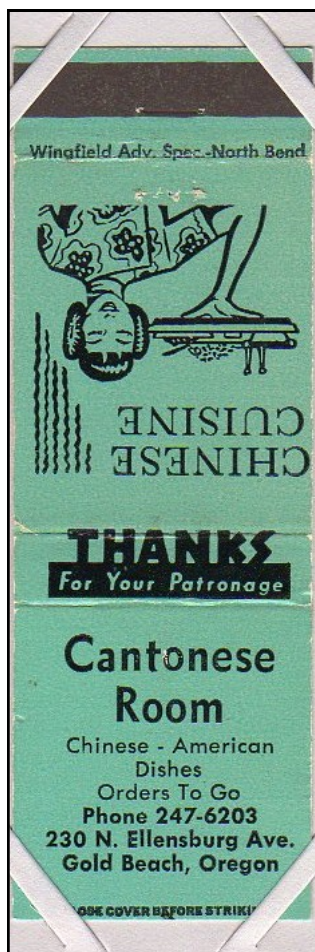
Reverse side of page, not using crossbars