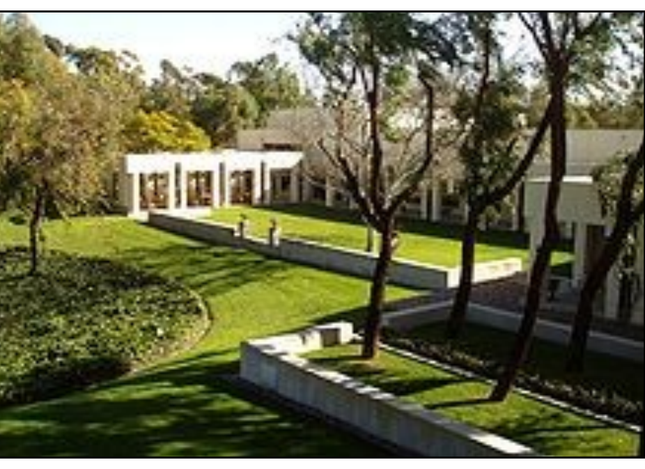
The National Academies' Beckman Conference Center, Irvine, California